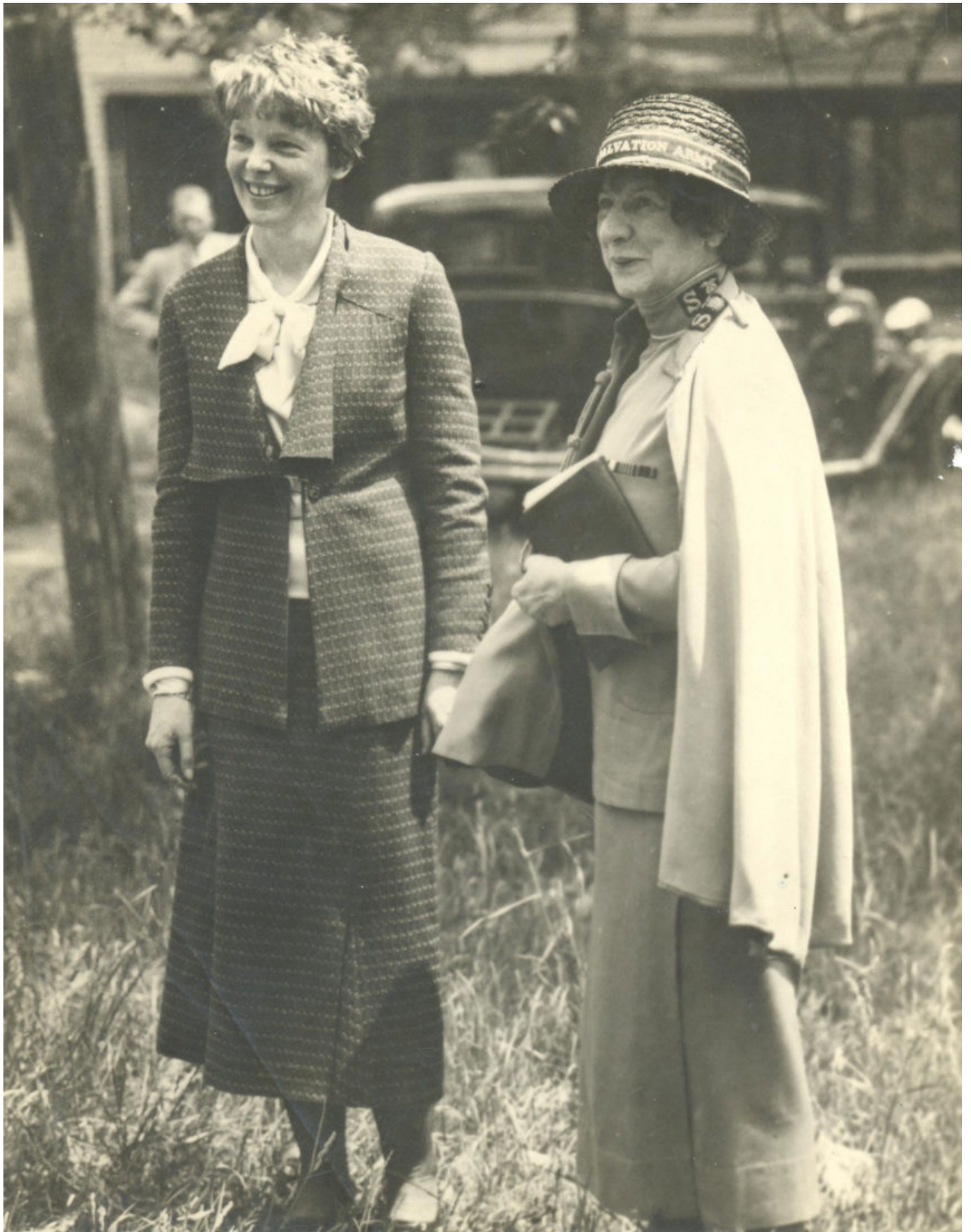
Amelia Earhart with Evangeline Booth