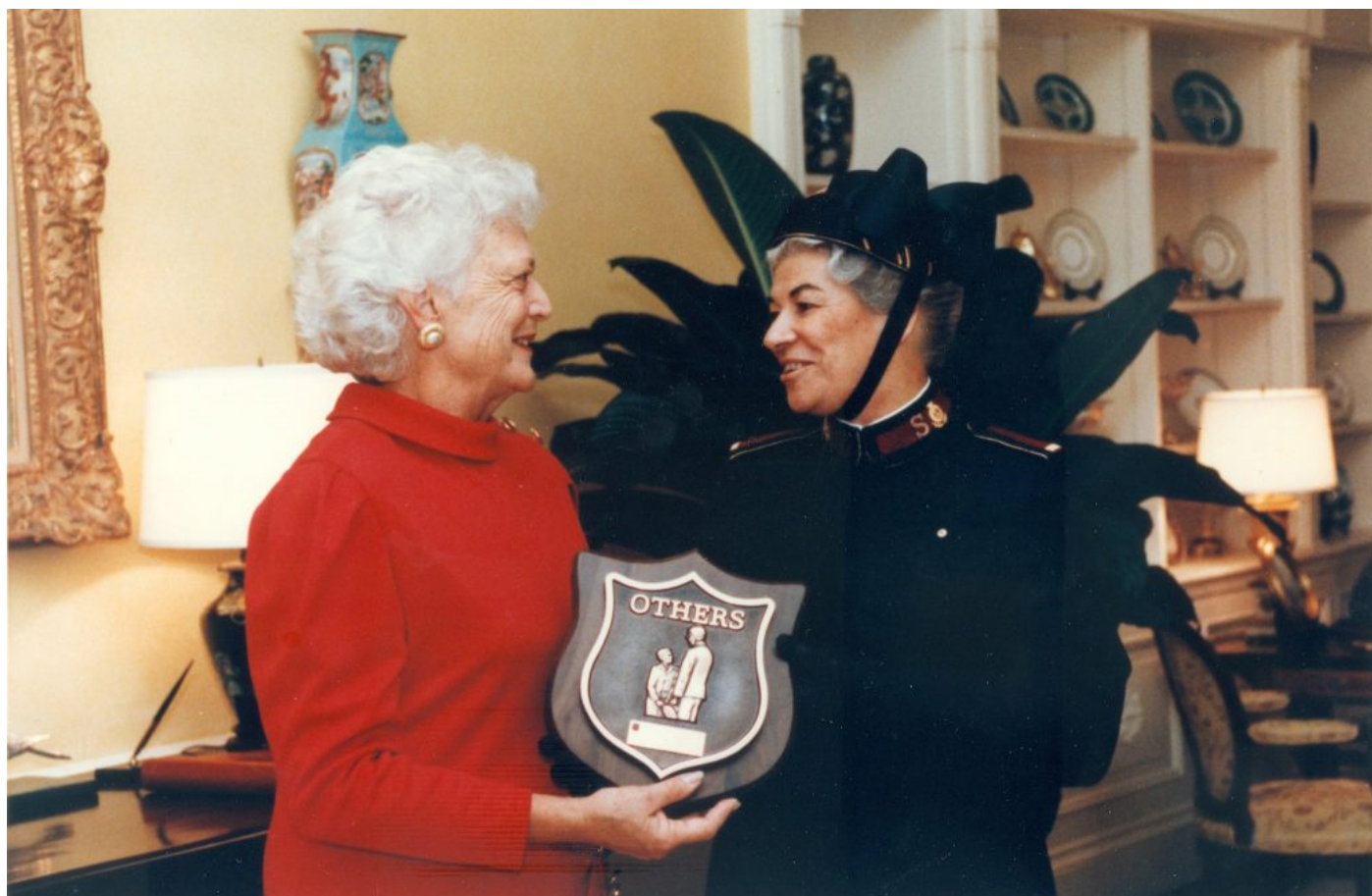
Featured Image: The First Lady Mrs. Barbara Bush and General Eva Burrows of The Salvation Army