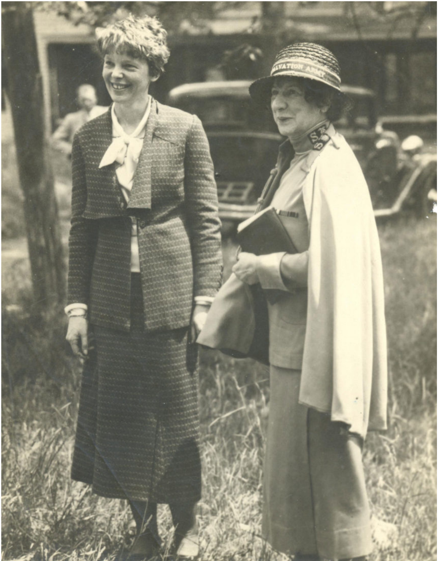
Commander Evangeline Booth and Aviator Amelia Earhart.